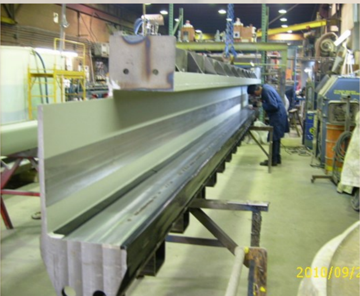
New Embedded Parts