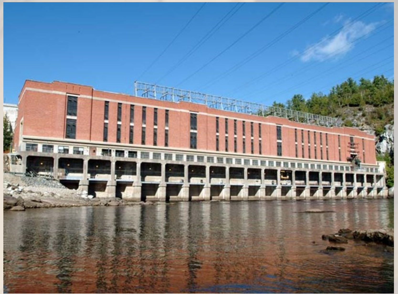
Downstream View - Powerhouse

Services : Detailed engineering for the replacement of bulkhead gates, intake gates and embedded parts.