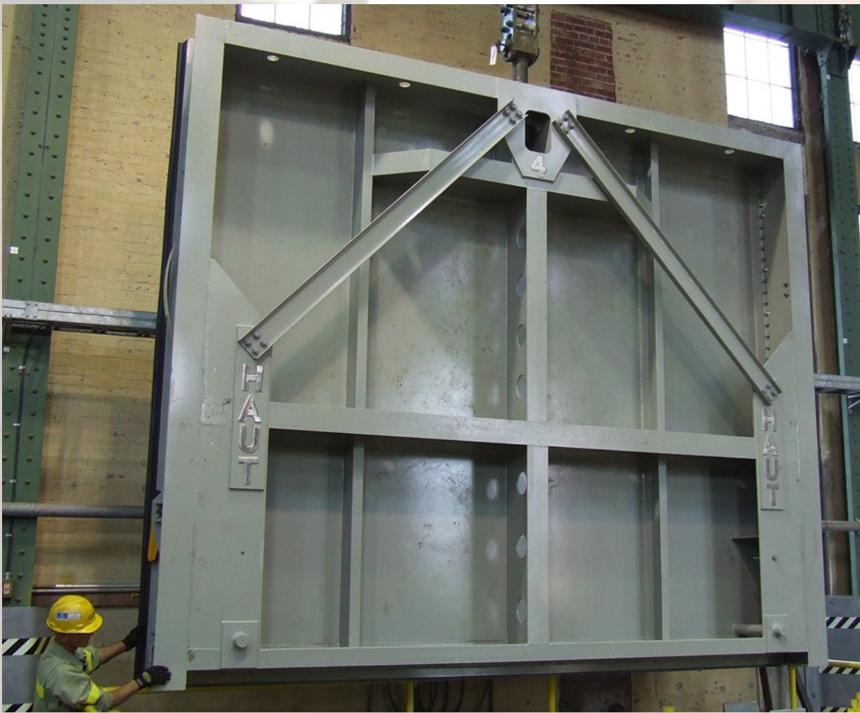
New Bulkhead gate Top Section (1 of 4)