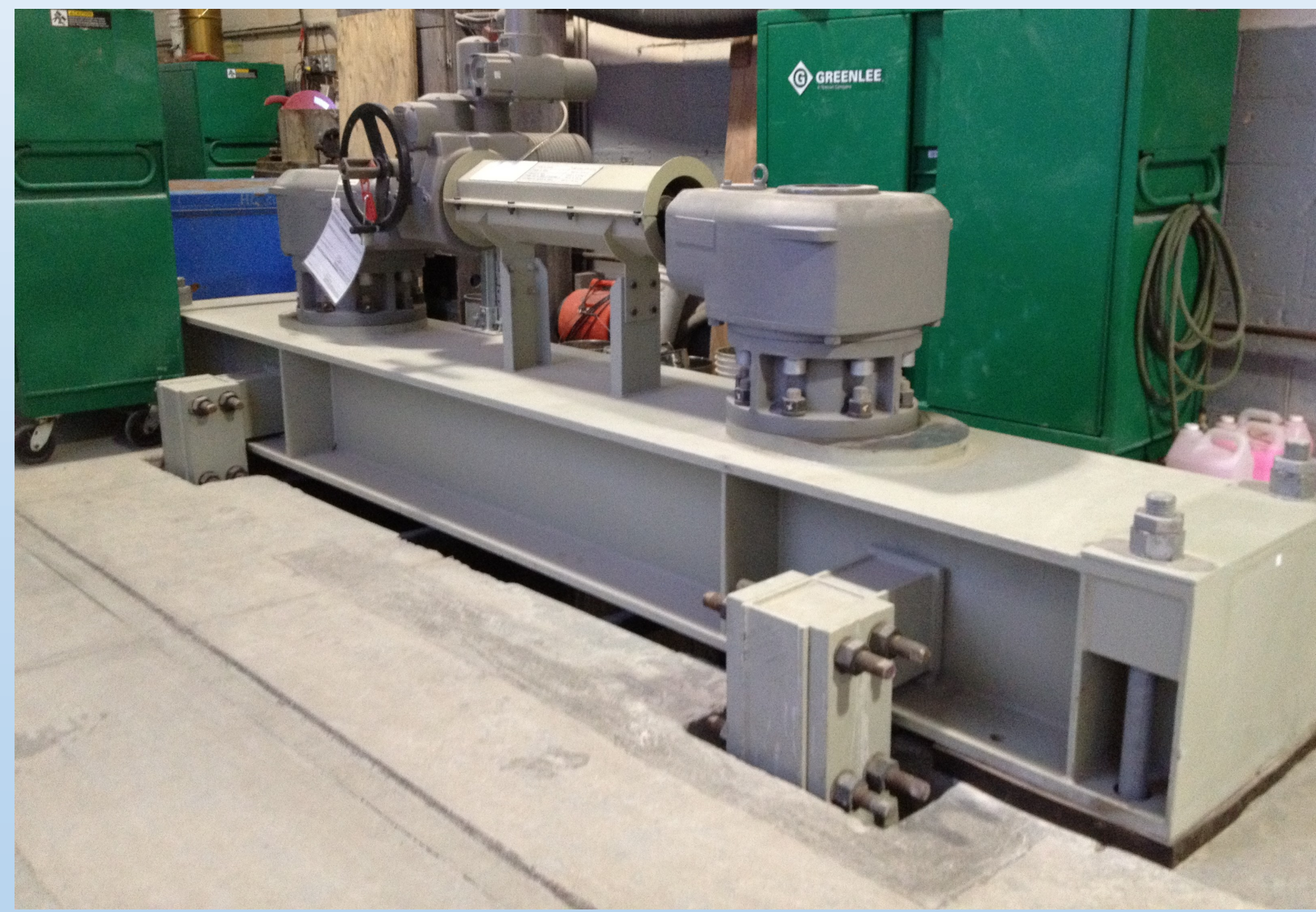
Screw Hoist After