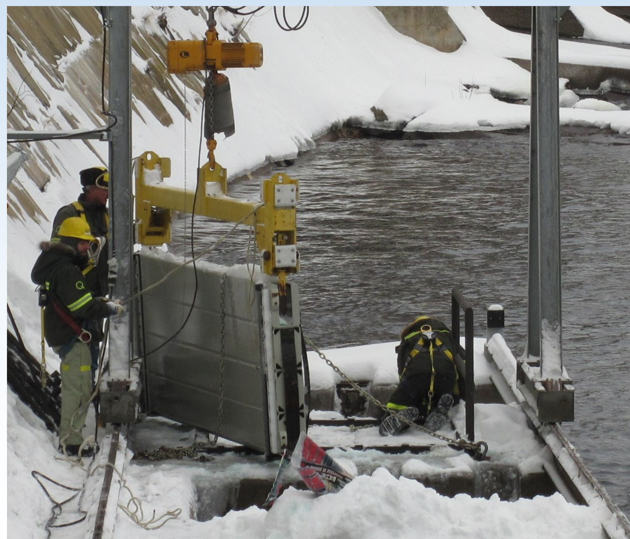
Downstream Bulkhead Gates