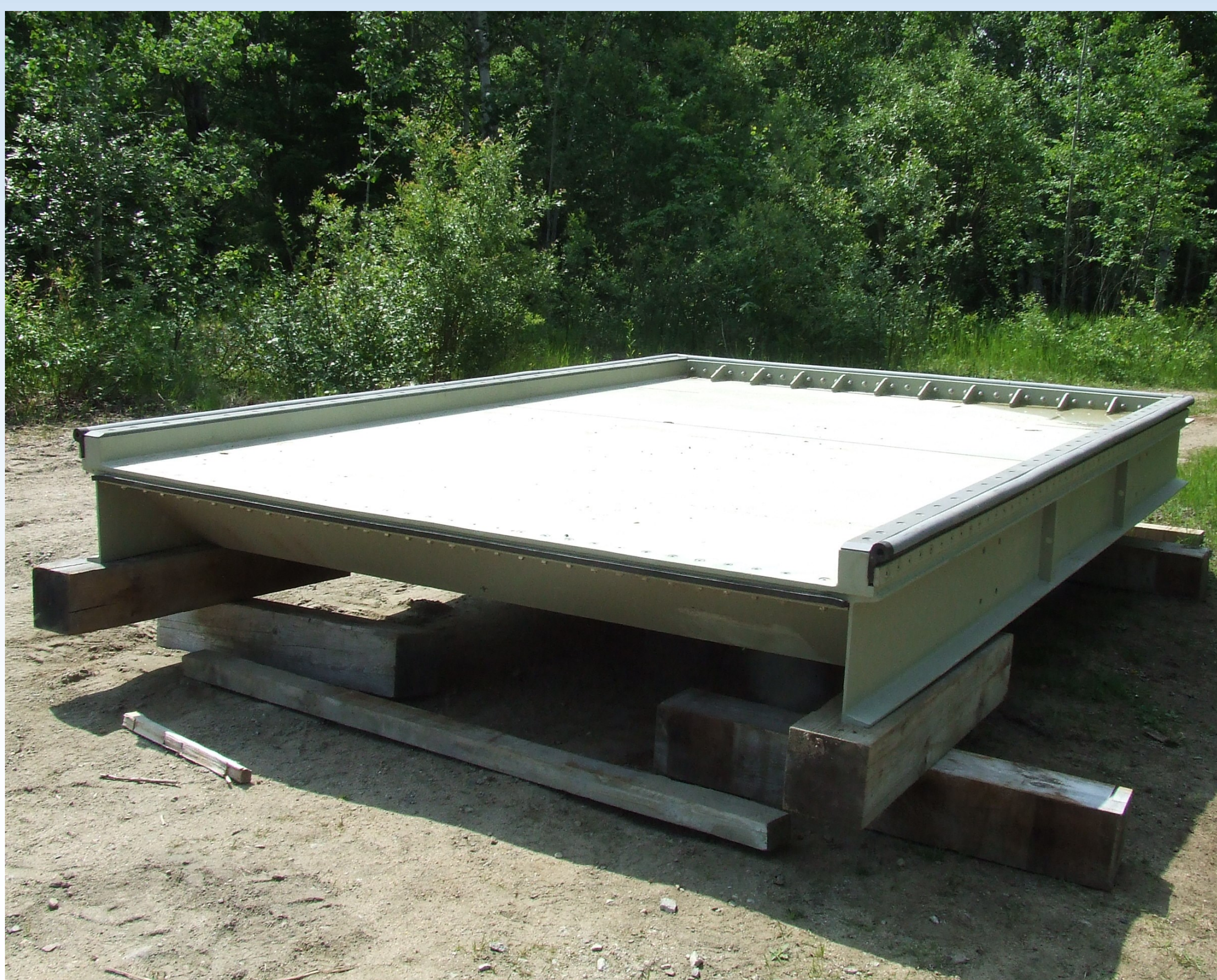
High Head Gates