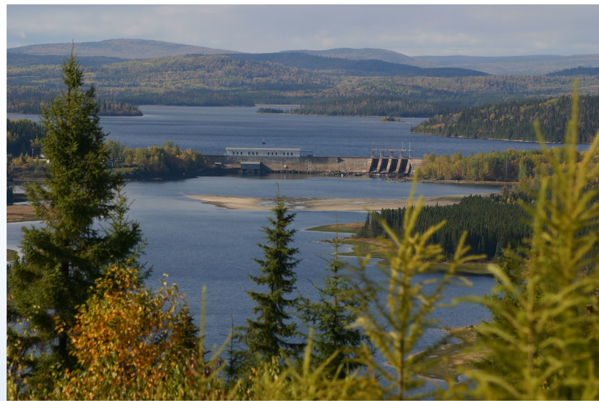
Overview of the Dam

Description : Refection of the high head gates, screw hoists, embedded parts and bulkhead gates.