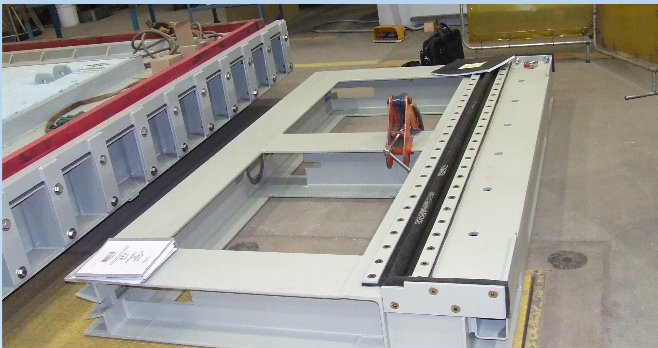
Upstream Bulkhead Gates