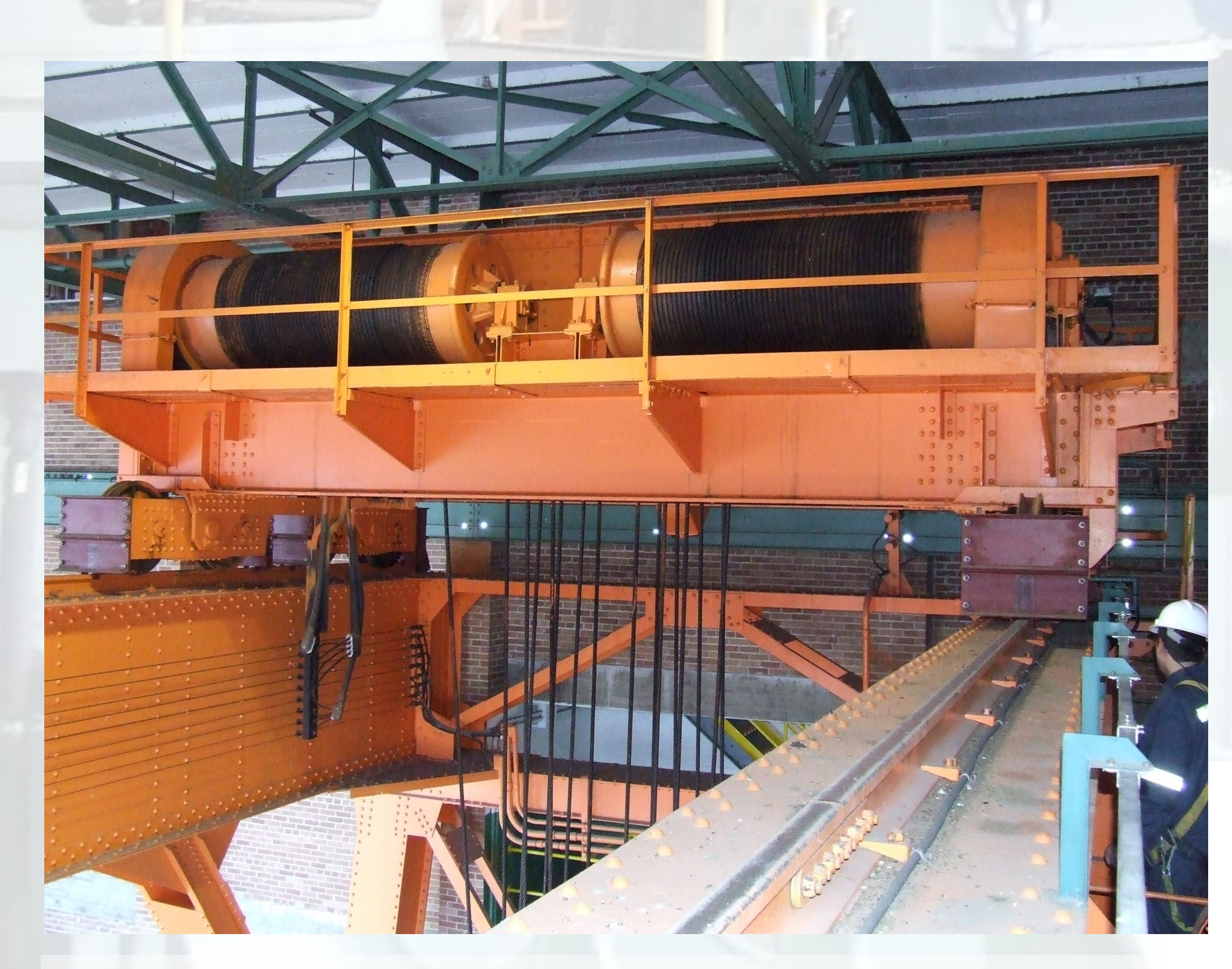
Hoist of the Gantry Crane in the Powerhouse Before