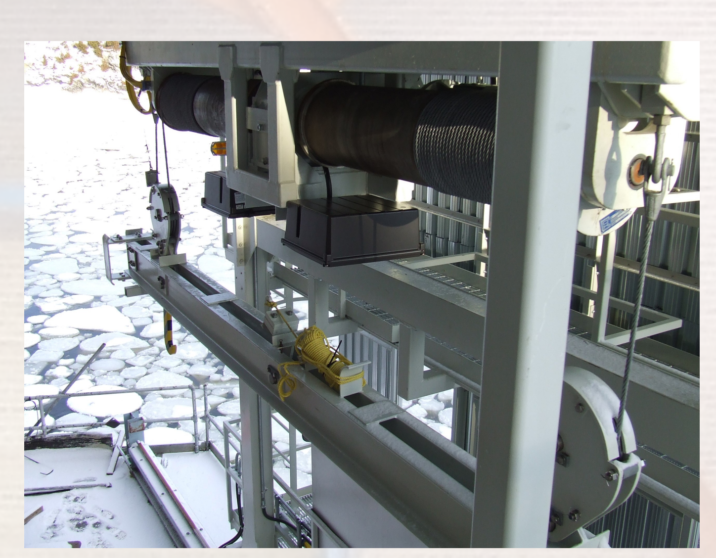
Lifting Hoist and Lifting Beam Downstream Gantry Crane After