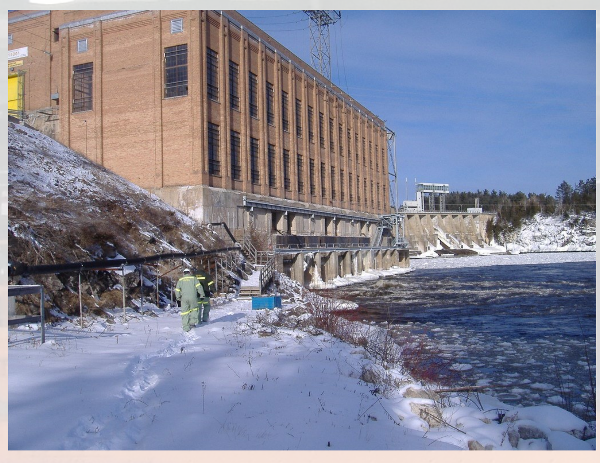
Downstream View - Powerhouse