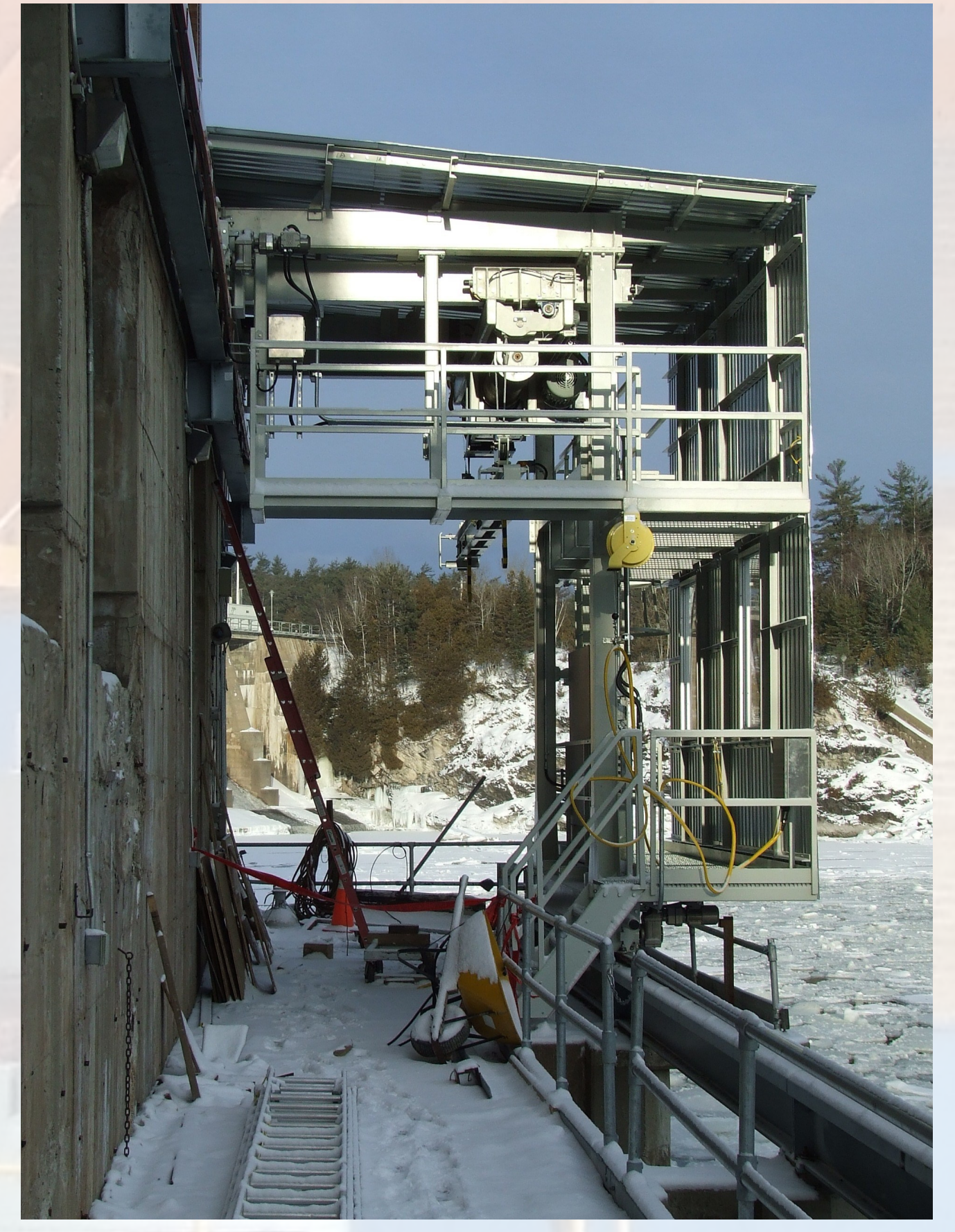
Downstream Gantry Crane After